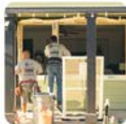
WINDOWS AND DOORS

9380 Orangevale Ave., Orangevale CA, 95662 License No. 627677