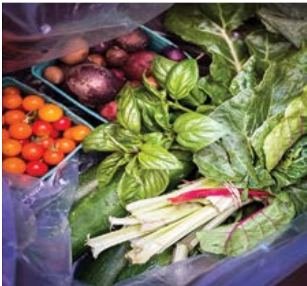
Local Veggie Box Program Now Open for Sign-Ups Page 9

Stay tuned to see their artwork featured in the upcoming 2027 Orangevale Water Company calendar. Congratulations to all of the students who participated this year.