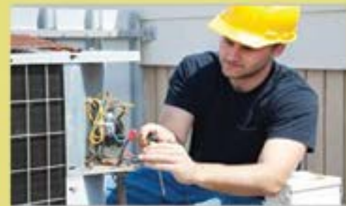
INSTALL AND REPAIR