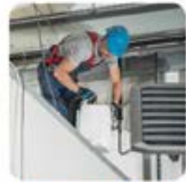
HEATING AND AIR