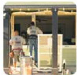
WINDOWS AND DOORS

9380 Orangevale Ave., Orangevale CA, 95662 License No. 627677